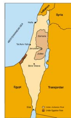
1949 Armistice. Transjordan occupies West Bank and Egypt occupies Gaza.