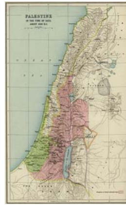
Palestine in the time of Saul 1020 BC (1915 map)

A homeland for Arab Palestinians? Of course, they deserve one. They have such a country. It's Jordan. Jordan (77% of the British Mandate) is Arab Palestine. Never in history has there been an Arab state in Judea and Samaria, and there certainly was never any mention of it during the 19 years of Transjordanian occupation.