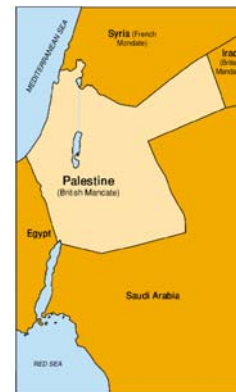
Palestine under British Mandate in 1920