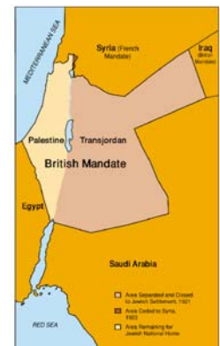
In 1923 British create an Arab state of Transjordan on 78% of the Mandate Palestine