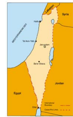
1967 Israel Captures West Bank and Gaza in a defensive war.