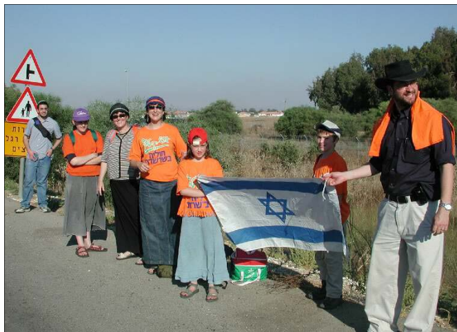
Over 200,000 people showed their support by creating a human chain from Jerusalem to Gaza

Outside the Consulate General of Israel to NE (20 Park Plaza, Boston, MA)