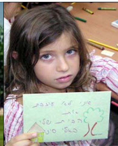
"I am not going to leave my home" reads the card of a Jewish Girl, living in Gush Katif